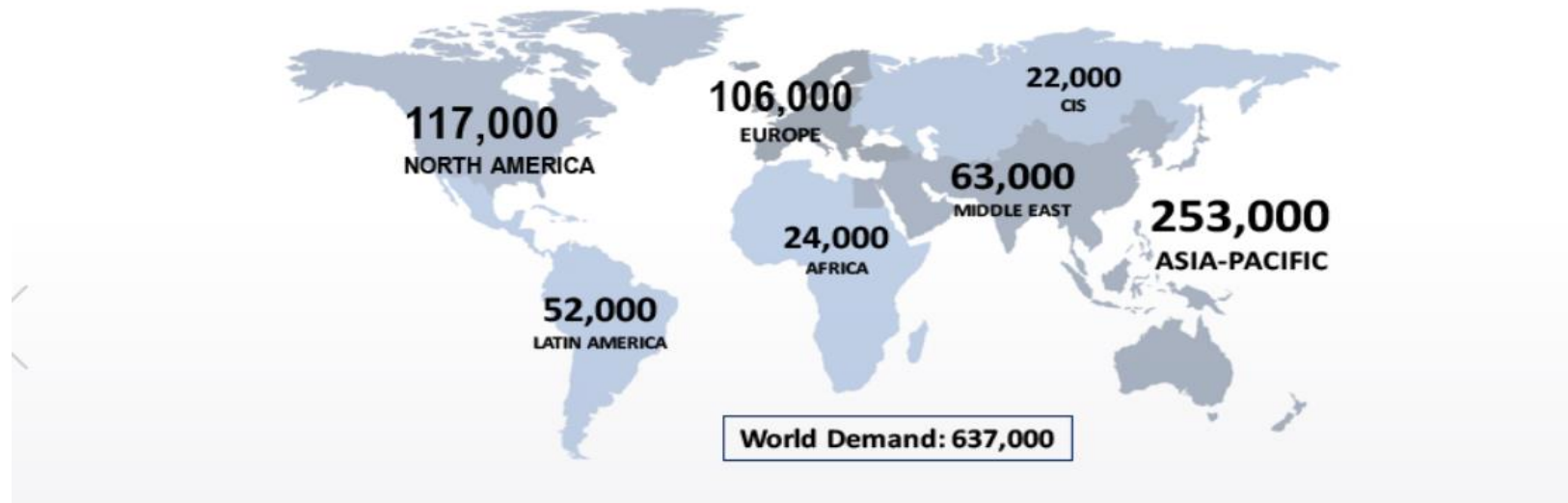
New Pilots by Region 2017-2036