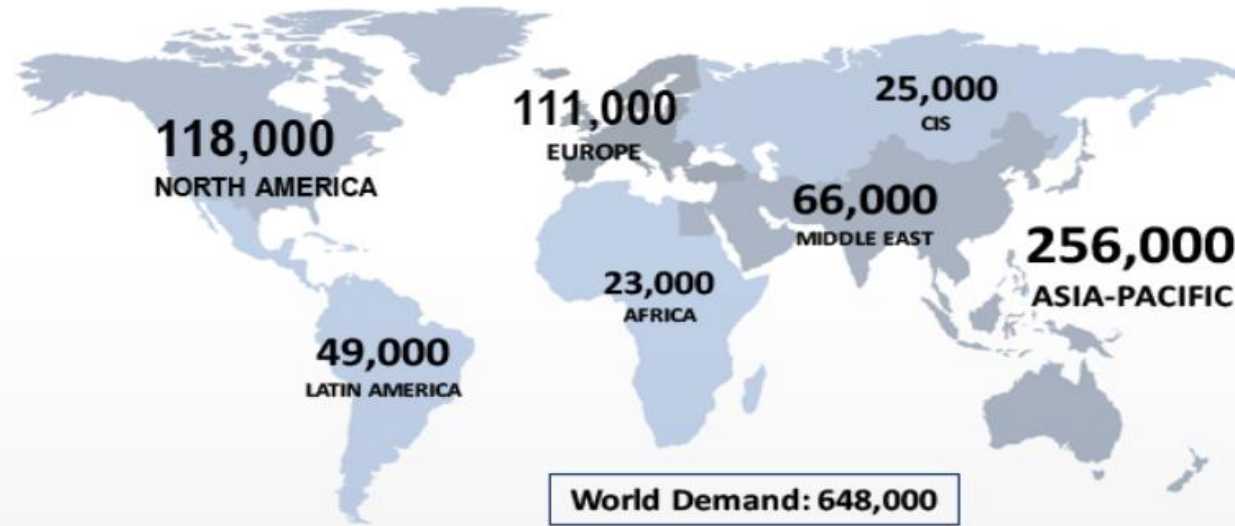
New Technicians by Region 2017-2036